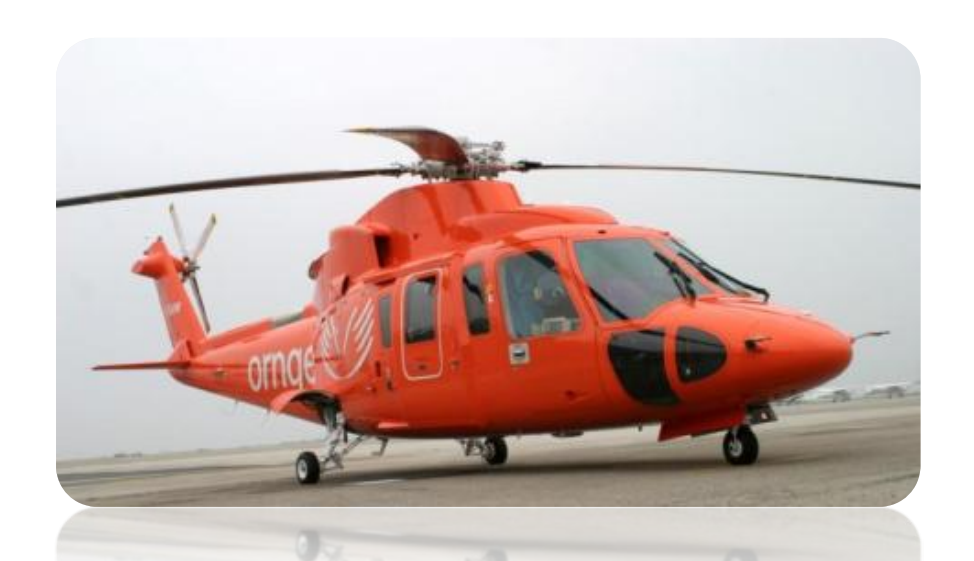
Sikorsky S-76 helicopters based in Kenora, Thunder Bay and Moosonee