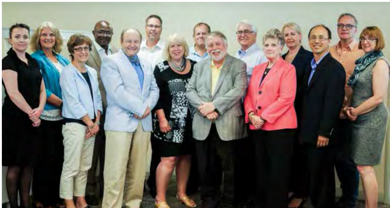
Group photo of the panel members, co-chairs and provincial staff.

The Panel wishes to acknowledge the work of the staff members from the Housing Policy Branch, Ministry of Municipal Affairs and Housing, and the Poverty Reduction Strategy Office, Treasury Board Secretariat, who contributed expertise, research, writing and other support to this process.