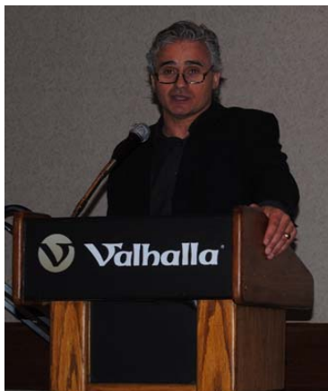
Hon. Bill Mauro, Minister of Natural Resources and Forestry