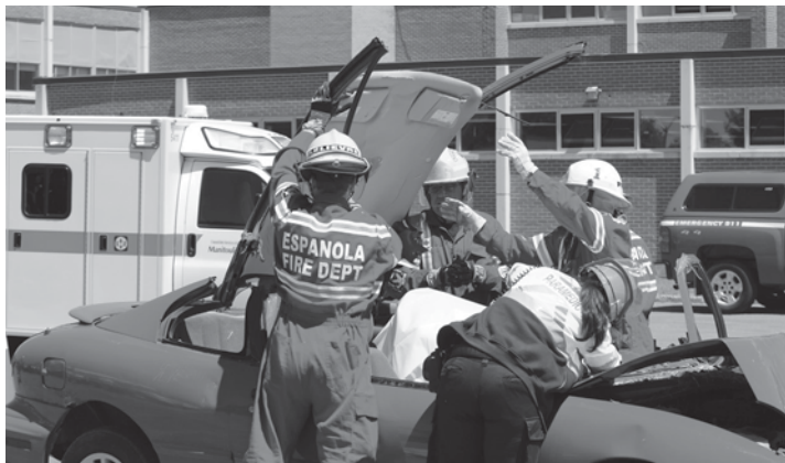
Photo: Espanola volunteer firefighters use the “jaws of life” to gain access to accident victims.