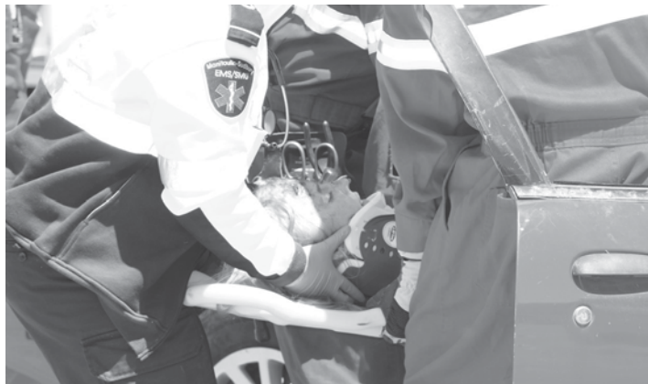
EMS personnel extract a victim from one of the cars.

fatally injured. Once students had gathered around, a 9-1-1 call was placed and Espanola Police arrived. After that, members of the Espanola Volunteer Fire Department were dispatched to begin assessing damage and preparing the “jaws of life” to rescue two victims who were not able to be removed from one of the cars otherwise. EMS rounded out the complement of first responders and treated the mock up as if it were a real life accident. For more than